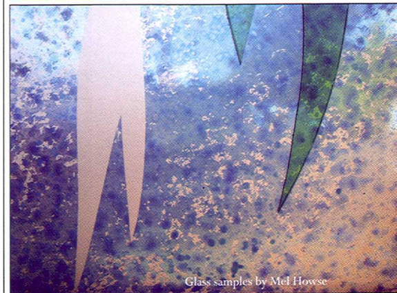
Glass samples by Mel Howse

which in summary include: a poorly located main entrance not visible from the village or to beckon passers-by; the absence of a welcome area; under-used sections of the church; poor sightlines; uncomfortable and 'inflexible' pews; a lack of kitchen and toilet facilities; and cramped office space.